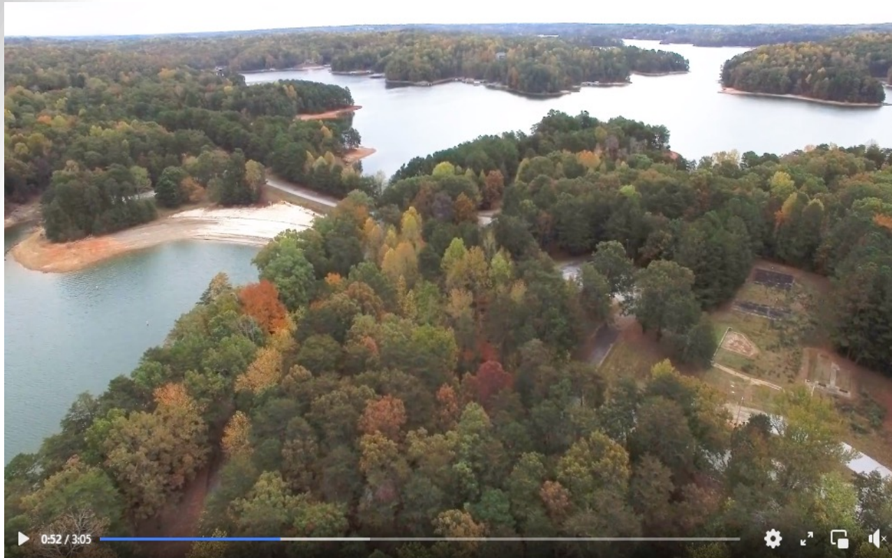
Hall County Parks WIN

https://www.facebook.com/watch/?v=1740020473177136&extid=CL-UNK-UNK-UNK-AN_GK0T-GK1C&ref=sharing&mibextid=Nif5oz